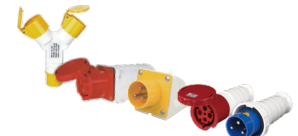
HD series industrial plugs & sockets