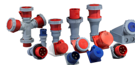
HIPS series industrial plugs & sockets